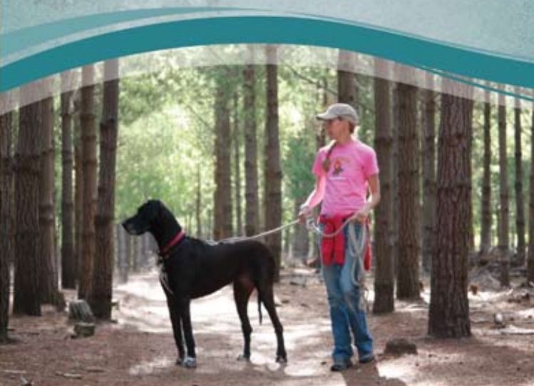
Table Mountain National Park

A Park for All, Forever 'n Park vir Almal, vir Altyd iPaka yoluntu lonke ngonaphakade